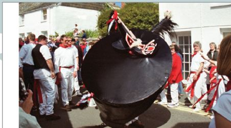
The Padstow 'Obby Oses' emerge from their stables on the morning of May 1 and return by midnight. An ancient fertility rite, some believe that the festivities date back to Iron Age times and may be linked to a forgotten religion which venerated horses. One legend says it began with Trevelyan, the only person who escaped the drowning of the legendary kingdom of Lyonesse in an earthquake by fleeing the intruding sea on a black horse.