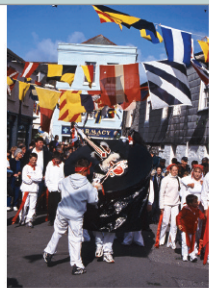
With its teaser in front, the Red Ribbon Ose gyrates towards the quayside.