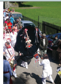
The Red Ribbon Ose party leaving Prideaux Place, the manor house of Padstow.