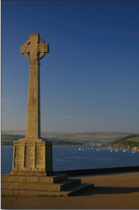
The Celtic-style memorial to the men of Padstow who lost their lives in two world wars.