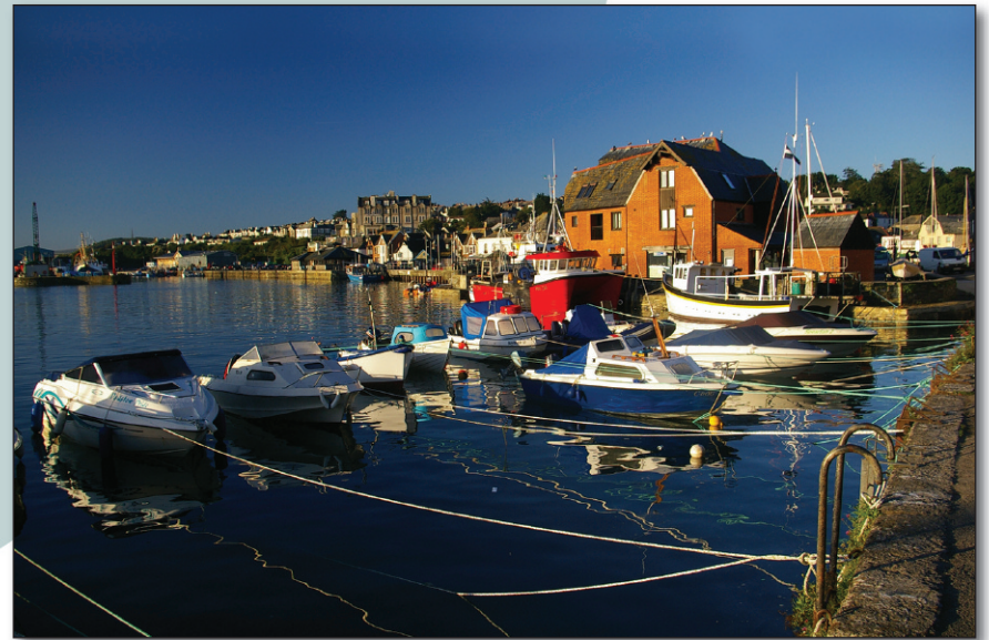
Early morning sunshine catches the harbour at its finest. Padstow is renowned for its deep azure skies, often referred to as the 'Padstow Blue' effect.