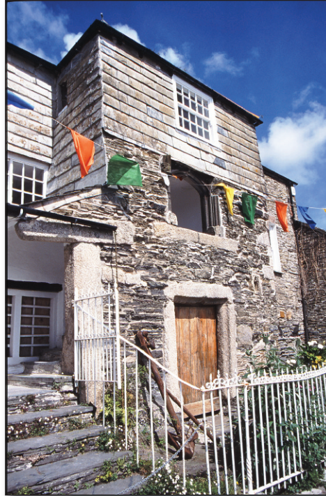
Medieval Abbey House on North Quay is Padstow's oldest building and is said to have a secret tunnel leading beneath the hill to Prideaux Place.