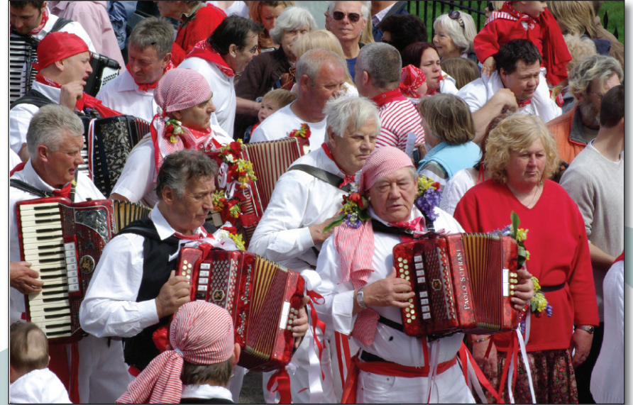
Padstow May Day song